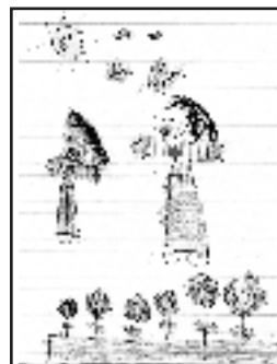
Drawing by 7 year old in the New Ground Program. Self portrait with her Social Worker, presented as a thank you for attending camp this past summer.

New Ground strives to provide every child in the program with an opportunity to attend summer camp, with the intention of ensuring each child has a summer to remember. When they return to school in the fall they too can write about what they did over the summer with positive memories of this experience. As the warmer weather comes, we are again making plans to enroll our New Ground children in day or sleep away camp. If you are interested in supporting our camp program please call New Ground for more information.